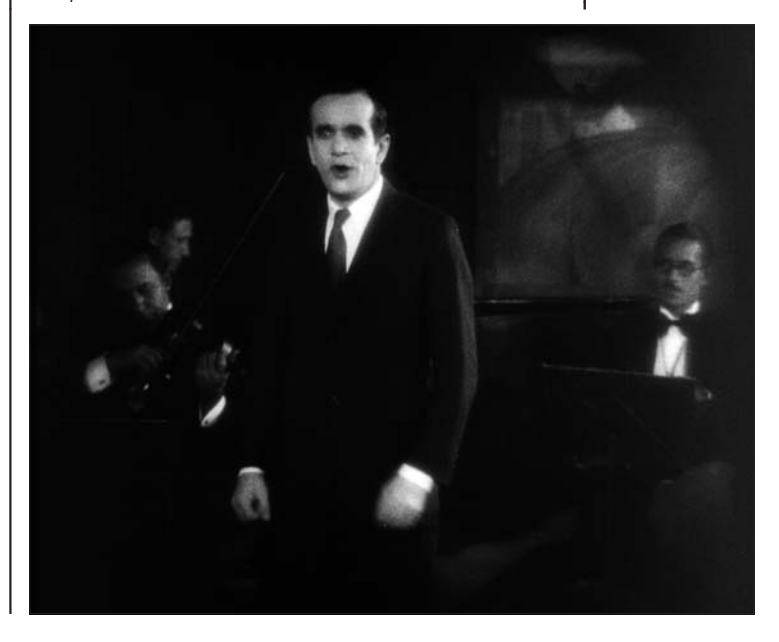
Figs. 8 and 9. In The Jazz Singer, Mary Dale is likewise enchanted by Jack Robin in performance.

theatrical entertainment-religious ritual that generated the melodramatic tension. The 1927 film's simultaneous appropriation of theatrical and cinematic antecedents rejects the stage-screen binary that had opposed dialogue-driven theatrical performance to silent, visual cinema in theory and practice.<sup>29</sup> In this respect, "the talkies" and this new sound film offered a means to transcend elements of the stage-silent screen distinction, and so this burden; such transcendence is also embodied in this mode of adaptation.