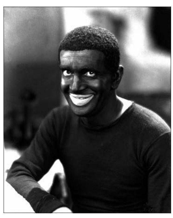
Fig. 12. Al Jolson, the blackface jazz singer.

"I got some burnt cork and put on a rehearsal for the benefit of the old man. In his opinion I