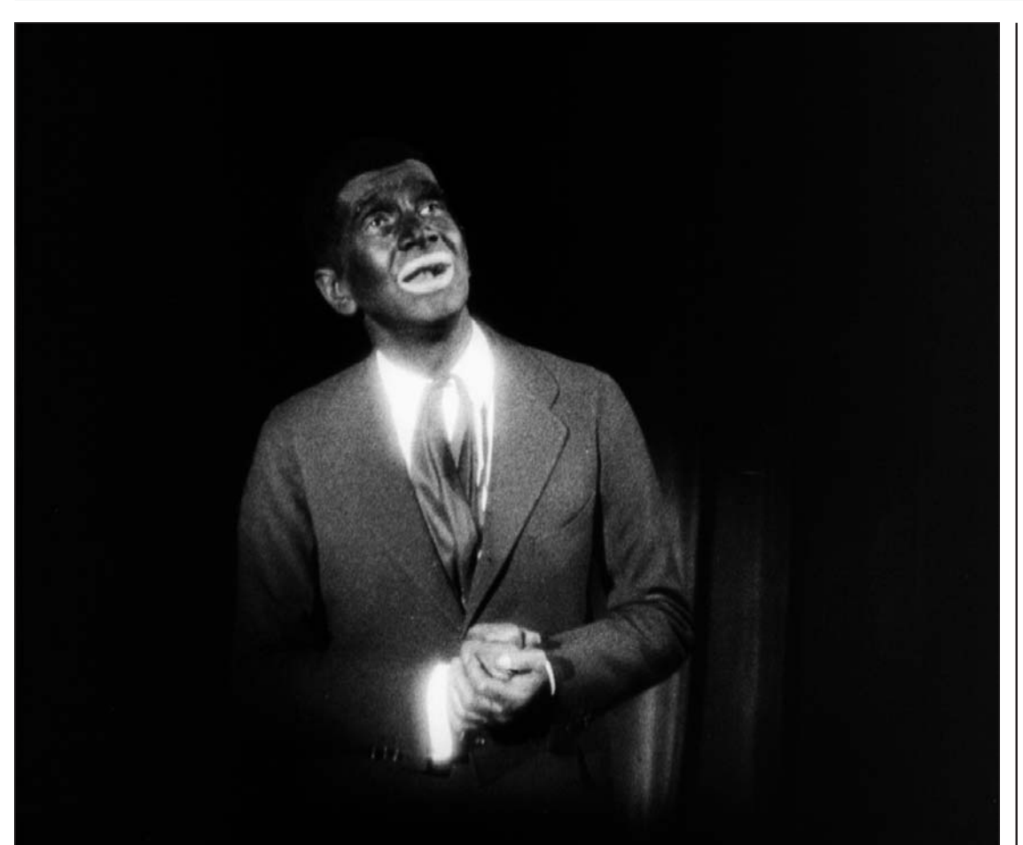
Fig. 19. Al Jolson sings "Mother of Mine".

You went away, Sweet Mammy! Mammy! One summer night.