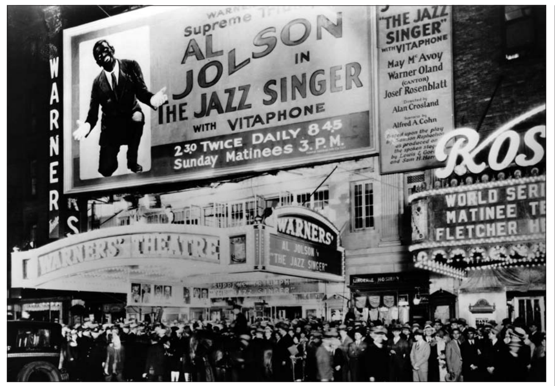
Fig. 1. The premiere of The Jazz Singer at the Warners' Theatre, Broadway and 52nd Street, New York City, 6 October 1927.