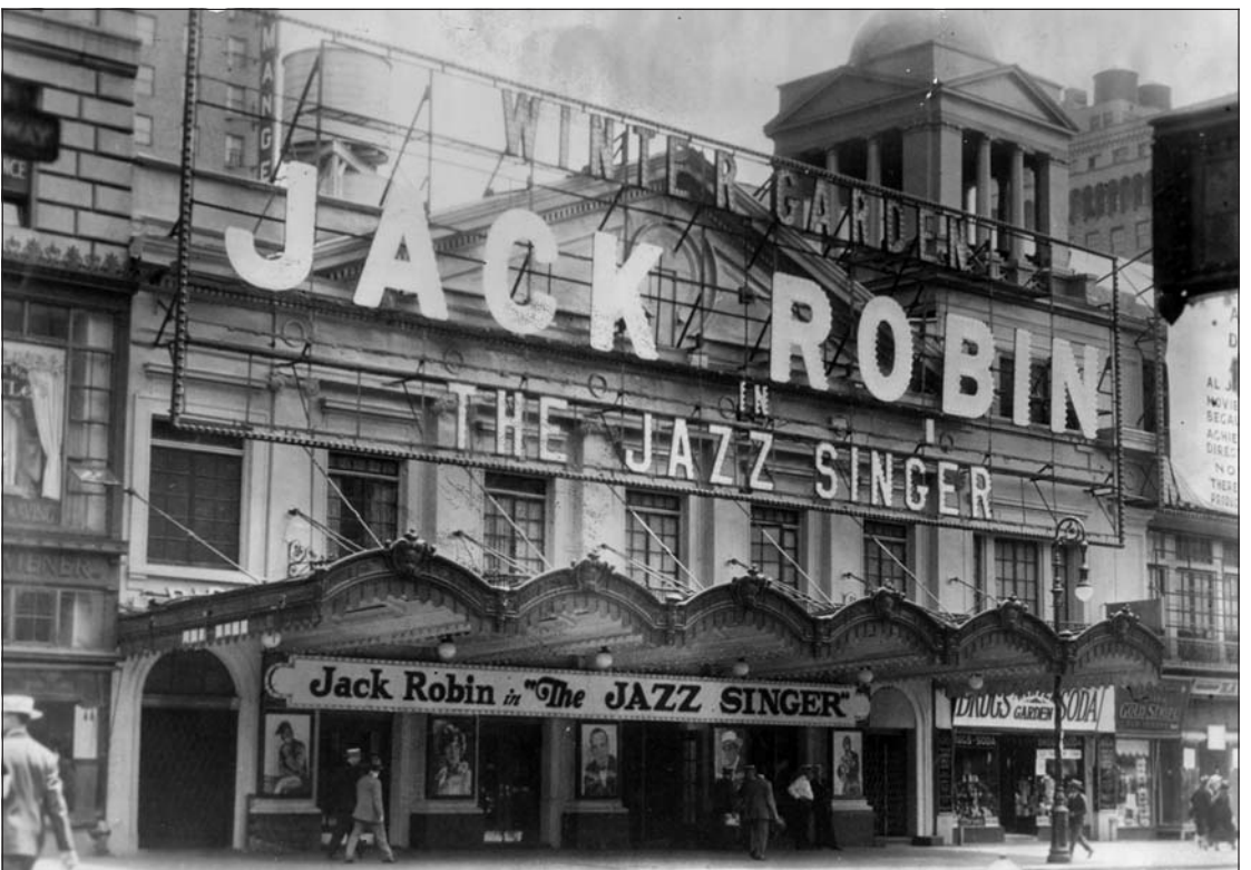
Fig. 2. The Winter Garden, site of Jolson's theatrical triumphs (and two blocks from the Warners' Theatre), dressed as the site of Jack Robin's breakthrough hit - The Jazz Singer.