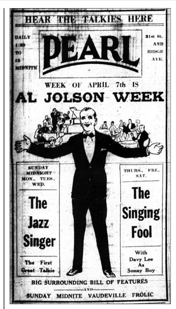
Fig. 11. Al Jolson Week at the Pearl. Advertisement, Philadelphia Tribune (4 April 1929).

a "2d GREAT WEEK", 15–22 April 1928. The holdover occurred because: