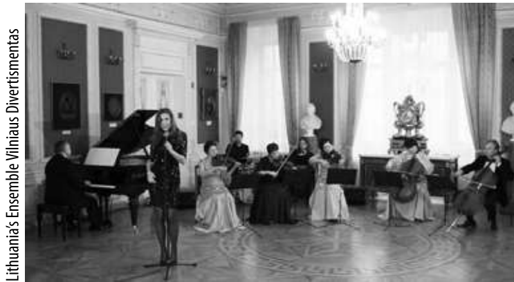
Lithuania's Ensemble Vilniaus Divertismentas

A funny thing happened on the way to this year's Jolson Festival. After having a great time, and a successful Festival in Philadelphia last year, we decided to head about 100 miles (that about 160 km for those on the other side of the pond) south to Baltimore and plan another memorable event for May, 2020. We secured a booking in a great facility that promised us all the rooms we needed, free parking, an unbelievable room rate, and even a major shopping center within walking distance. The outlook was for a phenomenal 70th Anniversary celebration. And then came two words which no one had ever thought they would have said: Global Pandemic. And there were other words as well: coronavirus, COVID-19, social distancing, shelter in place, lockdown. By February, it was becoming apparent that our annual get-together was in serious jeopardy.