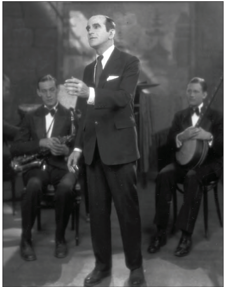
Al Jolson in The Jazz Singer.